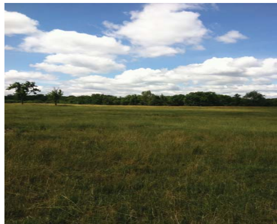
Third Winchester Battlefield

One result of the diversity of peoples and experiences in our society today has been an expansion in the reasons for which we wish to preserve special places. New concepts of cultural landscapes include the scenic, evocative, ethnic, and working landscapes, many of which overlap with lands preserved for ecological or traditionally historic reasons. This session explores a variety of land conservation concepts that are emerging, which not only celebrate the various communities represented in our increasingly pluralistic society, but add layers of emotionally appealing reasons for land protection.