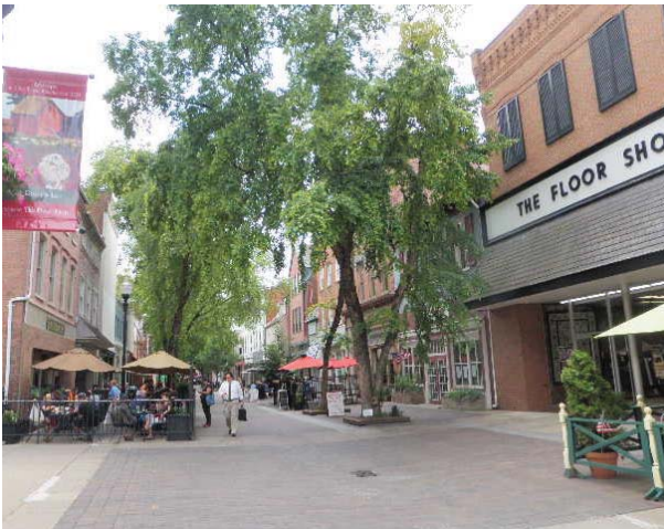
Winchester's downtown pedestrian mall

3:30 p.m. - 4:45 p.m. Winchester Walking Tour: Treasures, Challenges, and Opportunities