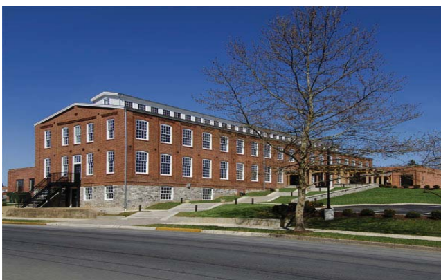
Lewis Jones Knitting Mill, c. 1895

5:00 p.m. - 6:00 p.m. Opening Reception at the Lewis Jones Knitting Mill Location: 126 North Kent Street