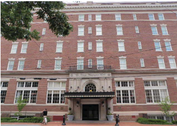
George Washington Hotel

3:00 p.m. - 5:00 p.m. Early Registration at the George Washington Hotel Location: 103 E. Piccadilly Street, Winchester, VA