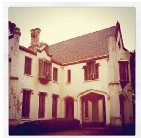
Belmead-on-the-James, c. 1845